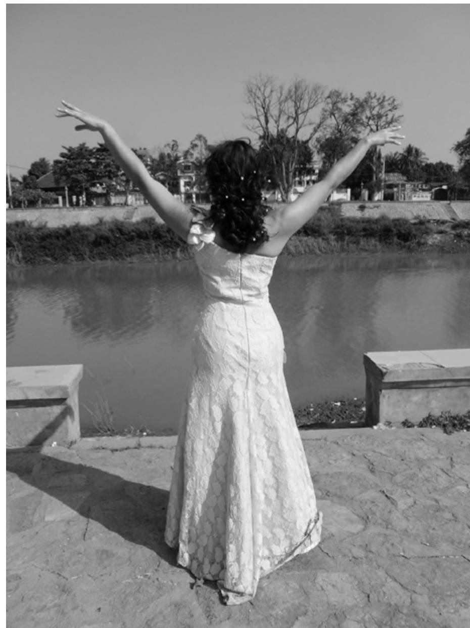
Dance Film , by Pry Nehru.