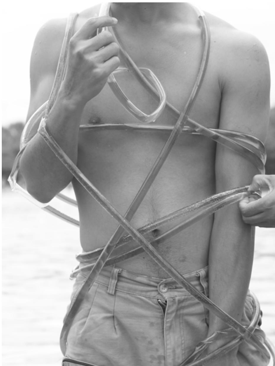
Recycle Water , by Nov Sokunthea.