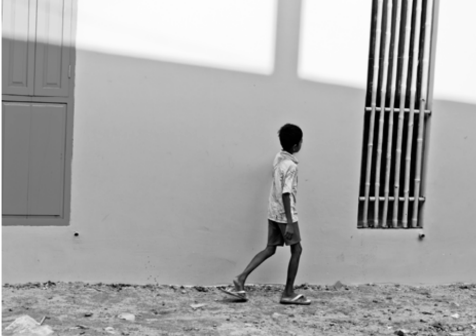
Building a Sustainable Future , by Komitu Architects and Kouk Khleang Youth Center.